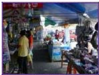
Banchang Central Shops & Market - 14 ...